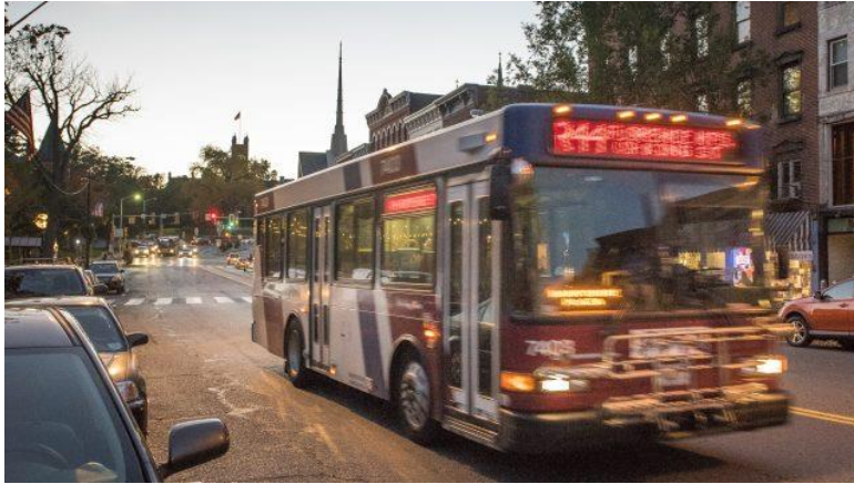
Published June 26, 2017